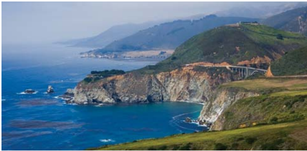
Big Sur Coastline