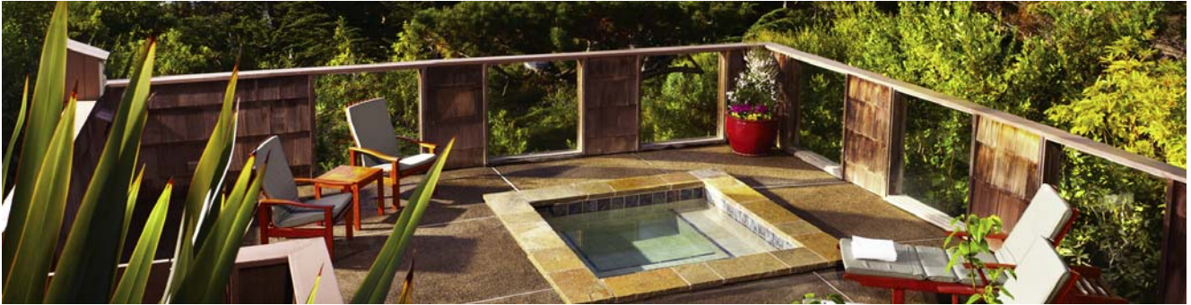
Updated 200s Spa