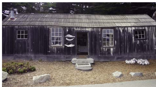
The Whaling Station Museum at Point Lobos

Once called the "greatest meeting of land and sea", this "crown jewel of the state park system" offers the visitor a chance to experience diving unmatched on the California coast, great hiking, perfect picnic spots, vistas and wildlife.