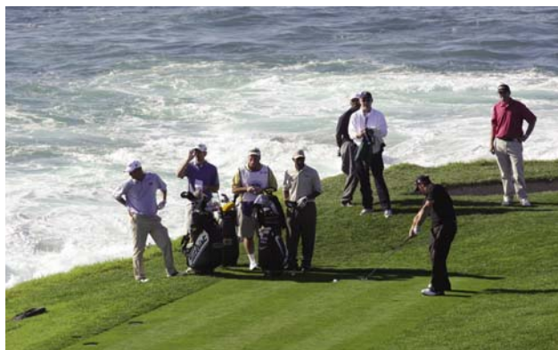
The AT&T Pro Am Pebble Beach

Dixieland Monterey festival is a weekend of traditional jazz and swing. Eight performance stages operate offering big band swing, traditional jazz, Gypsy jazz, and more for the true jazz connoisseur. For more information and tickets call 831-675-0298 or visit dixieland-monterey.com