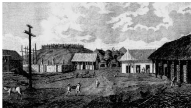
Carmel-by-the-Sea circa 1794

After the 1906 San Francisco earthquake, even more creatives flocked to the area to join the artists' colony. Carmel continues to be a mecca for artists and there is an abundance of art galleries featuring fine art, photography, sculpture and more.