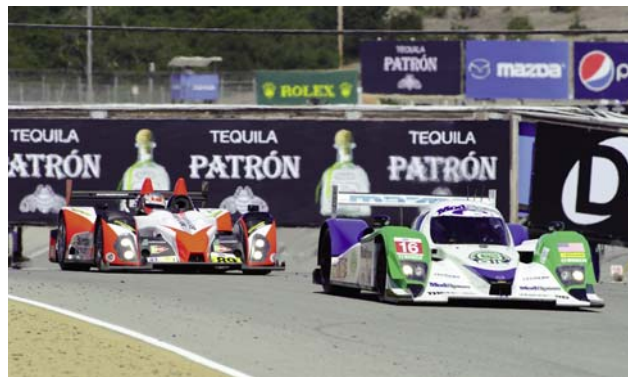
The American LeMans Monterey at Mazda Raceway Laguna Seca