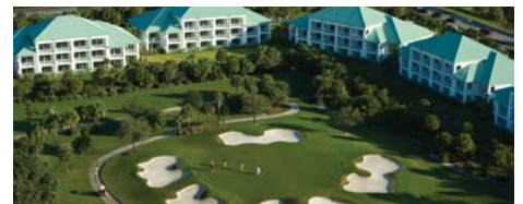
Hyatt Miami At The Blue, Doral, Florida