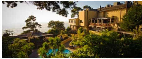
Highlands Inn, A Hyatt Residence Club Resort, Carmel, California