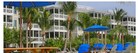
Beach House, A Hyatt Residence Club Resort, Key West, Florida