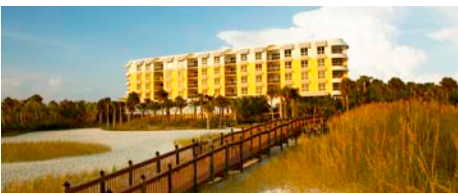
Siesta Key Beach, A Hyatt Residence Club Resort, Siesta Key, Florida