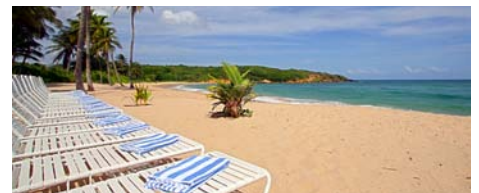
Hacienda del Mar, A Hyatt Residence Club Resort, Dorado, Puerto Rico