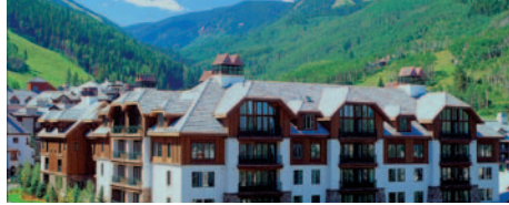
Mountain Lodge, A Hyatt Residence Club Resort, Avon, Colorado