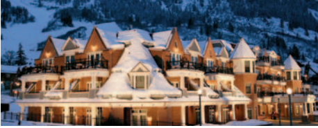
Grand Aspen, A Hyatt Residence Club Resort, Aspen, Colorado