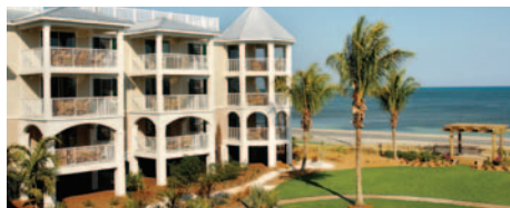
Windward Pointe, A Hyatt Residence Club Resort, Key West, Florida