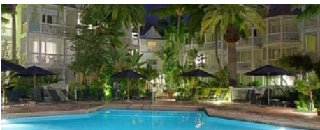
Sunset Harbor, A Hyatt Residence Club Resort, Key West, Florida