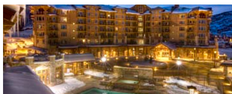
Hyatt Escala Lodge, Park City, Utah

Call Us Or Visit The Website Today Book Your Week NOW! 1-800-GO-HYATT www.hyattresidenceclub.com