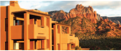
Piñon Pointe, A Hyatt Residence Club Resort, Sedona, Arizona