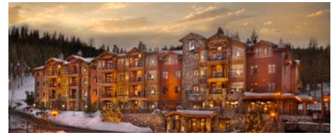
Northstar Lodge, A Hyatt Residence Club Resort, Truckee, California