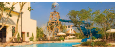
Wild Oak Ranch, A Hyatt Residence Club Resort, San Antonio, Texas