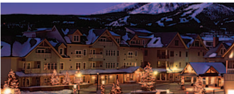
Main Street Station, A Hyatt Residence Club Resort, Breckenridge, Colorado