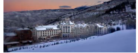
The Residences At Park Hyatt Beaver Creek, Beaver Creek, Colorado