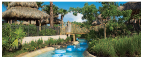
Coconut Plantation, A Hyatt Residence Club Resort, Bonita Springs, Florida