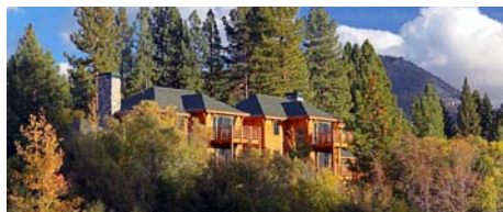
High Sierra Lodge, A Hyatt Residence Club Resort, Incline Village, Nevada